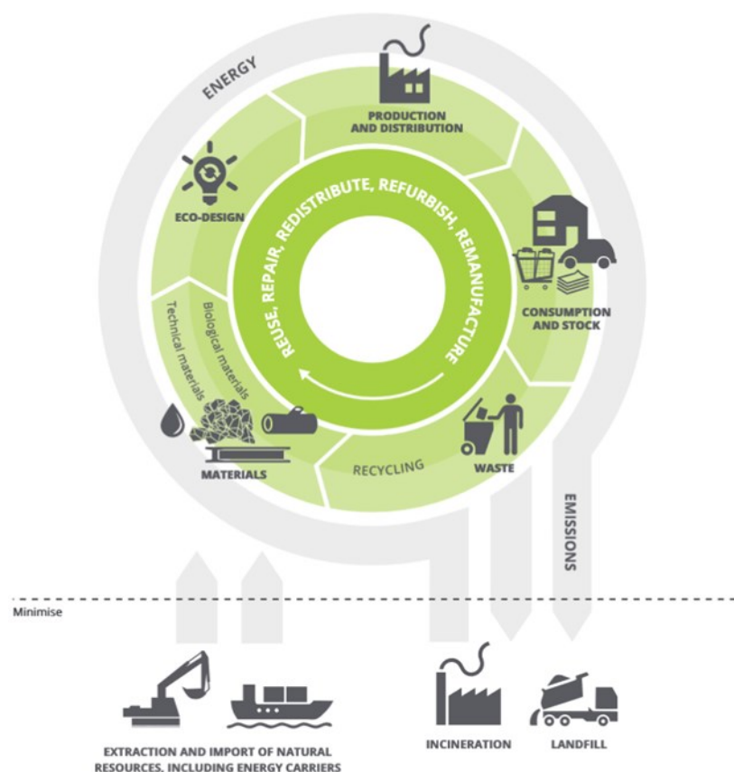
Image 18.1: A Simplified Model of the Circular Economy for Materials and Energy (European Environment Agency (EEA) 2016)

The principal objective of sustainable resource and waste management is to use resources more efficiently, where the value of products, material and resources is maintained in the economy for as long as possible such that the generation of waste is minimised. To achieve resource efficiency there is a need to move from a traditional linear economy to a circular economy (refer to Image 18.1).